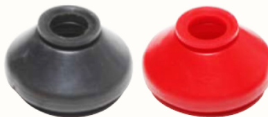
Tie Rod End Boots/Dust Covers: These direct replacement boots are offered in black neoprene or red vinyl. #001-60507 Black boot: $4.00 ea. #001-60508 Red boot: $4.00 ea.