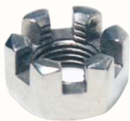
S/S Tie Rod End Castle Nut: 1/2"-20 RH thread. #001-62706: $8.00 ea.