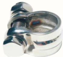
S/S Clamp Polished: Stainless steel clamp, polished. #001-63107: $12.95 ea.