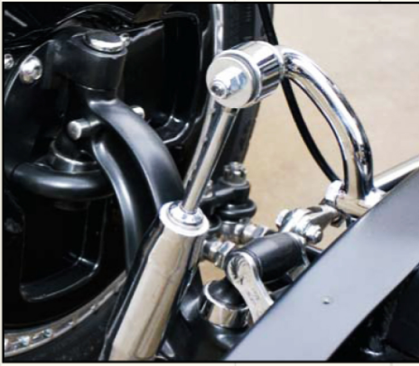
SO-CAL F1-style upper front shock mount for fendered cars, installed