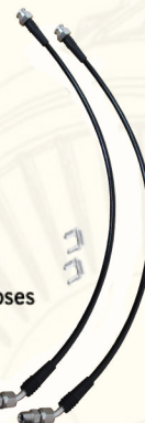
SO-CAL Brake Hoses See pg. #50