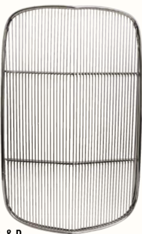
B. & D.