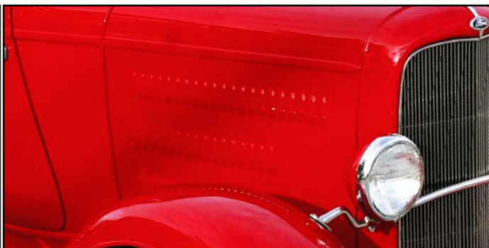
'32 Ford Hood: Various styles of Rootlieb hoods in stock. Call for pricing.