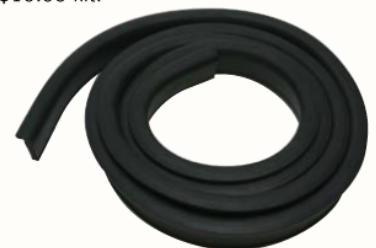
'32 Ford Firewall Seal: If you are using an original deuce body or a steel reproduction this firewall seal is a must. The seal plays an integral part of securing, sealing and adjusting the body to the frame via the stock cowl tie down bolts. #011-B-35336: $10.00 ea.