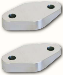
'32 Hood Latch Spacer: #001-62189: $19.90 pr. Sold in packs of two