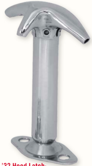
'32 Hood Latch: #011-B-16750-SS: $16.00 ea.