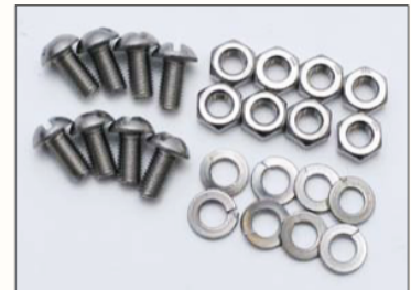
'32 Ford S/S Hood Latch Hardware Kit: #011-B-16750-SK: $7.50 kit