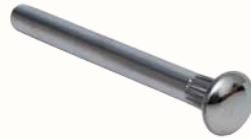
'32-48 Ford S/S Door Hinge Pins: Our S/S hinge pin measures 0.275" dia. x 2.75" long and fits all passenger cars and pickups. #011-B-46335-SS Hinge pin: $3.00 ea.