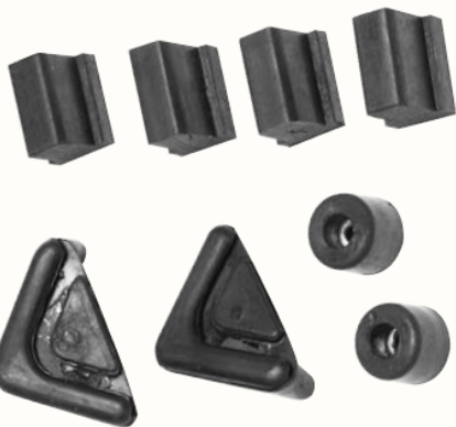
'32 Hood Bumper Kit: Protects hood corners, etc #011-B16761-S: $8.50 kit