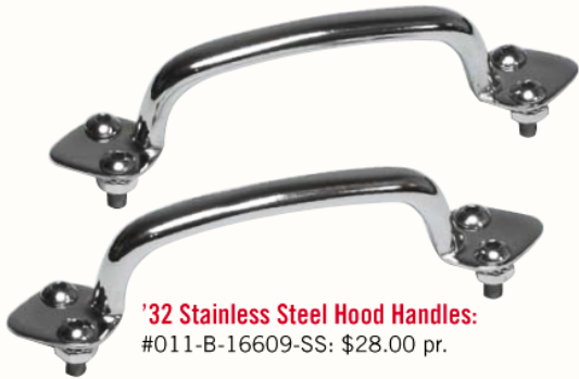
'32 Stainless Steel Hood Handles: #011-B-16609-SS: $28.00 pr.