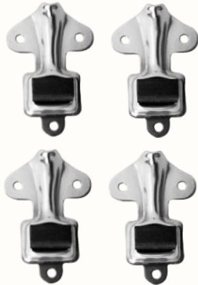
'32 Latch Pad Kit: #011-B-16750-HCSS: $40.00 Kit (fits one hood)