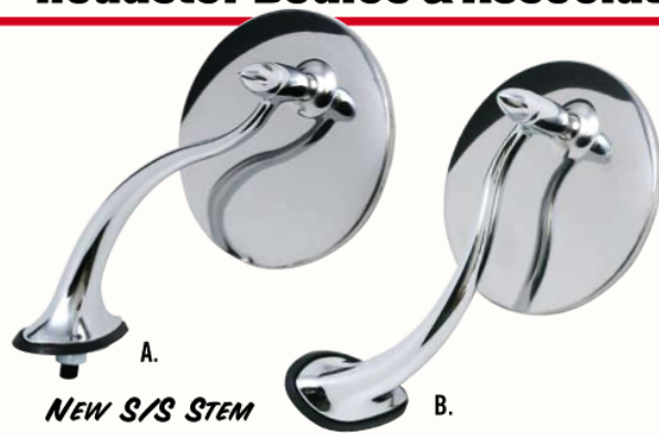
NEW S/S STEM

SO-CAL Swan Neck Outside Mirror: Now features a beautiful polished S/S swan neck design along with a 4" diameter stainless steel-backed mirror held in place by a sculptured bullet nut. Remember, these mirrors are great for all sorts of applications, including some fat-fendered cars, late models, pickups, VWs, etc.