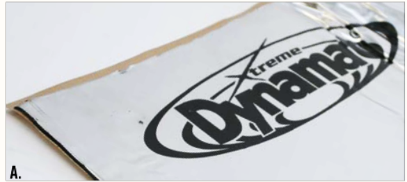
A. Xtreme Dynamat sound deadener